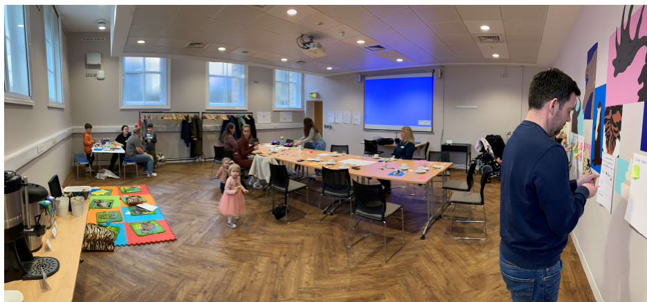
Photo of event

In total, 5 families attended the event. They comprised of 3 father/mother dyads, 2 mothers and 5 children (totaling 13 participants in total). To help run the event 1 nurse attended to help with facilitation, and 2 play workers attended to run activities for the children.